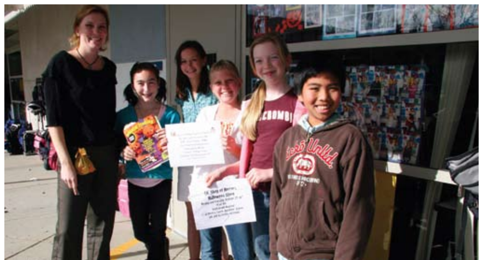
Students at Covington Elementary raised money for pediatric emergency services at Stanford Hospital.