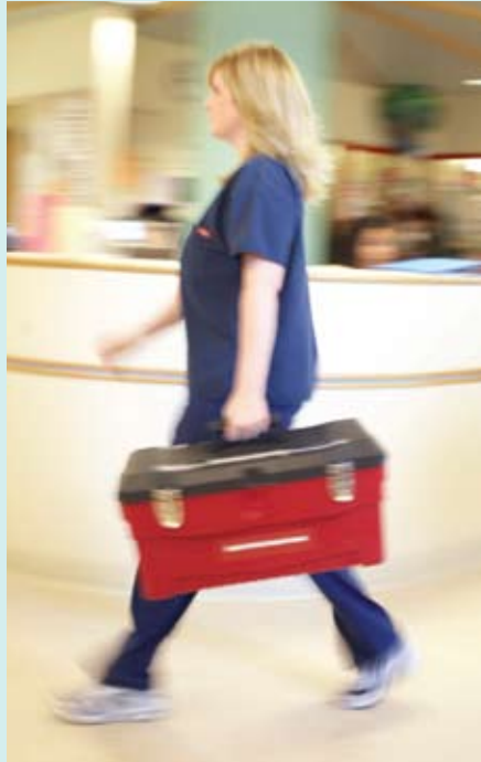
Packard's Rapid Response Teams provide bedside care before a child's condition becomes life threatening.

Rapid Response Teams are trained to provide supportive care in response to subtle warning signs before a child's condition becomes