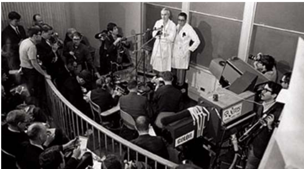
Norman Shumway, MD, and his team made international headlines in 1968 when they performed the first adult human heart transplant in the United States.

But the enthusiasm soon dampened due to the high rate of post-surgical deaths. Shumway persevered; for almost 10 years Stanford remained one of the only centers in the country to offer the operation.